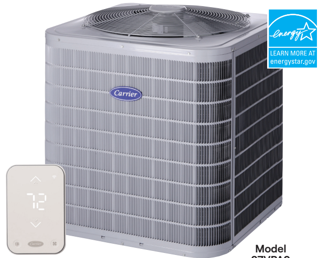
Model TSTATCCIEWF-01 1